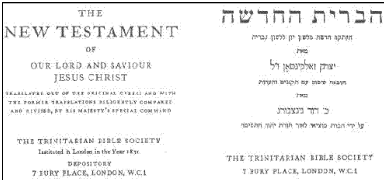
Figure 2. The English and Hebrew title pages from the Hebrew version J 18 .