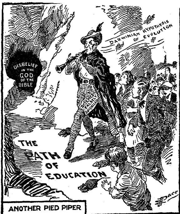
ANOTHER PIED PIPER